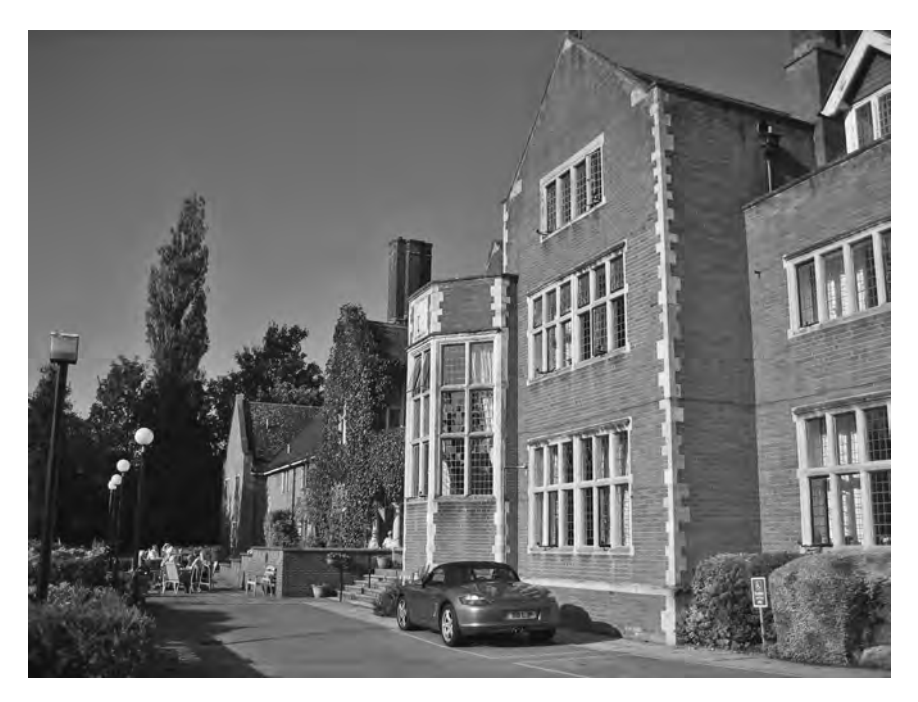
Figure 4 Milner House Care Home: photographed by the author, 2008

enabling disabled staff to carry out useful functions in a work situation. Leatherhead was part of the manufacturing services group and acted as a contract manufacturer engaged in the batch production of electro-mechanical and electronic equipment, as well as the assembly and packaging of a wide range of products.