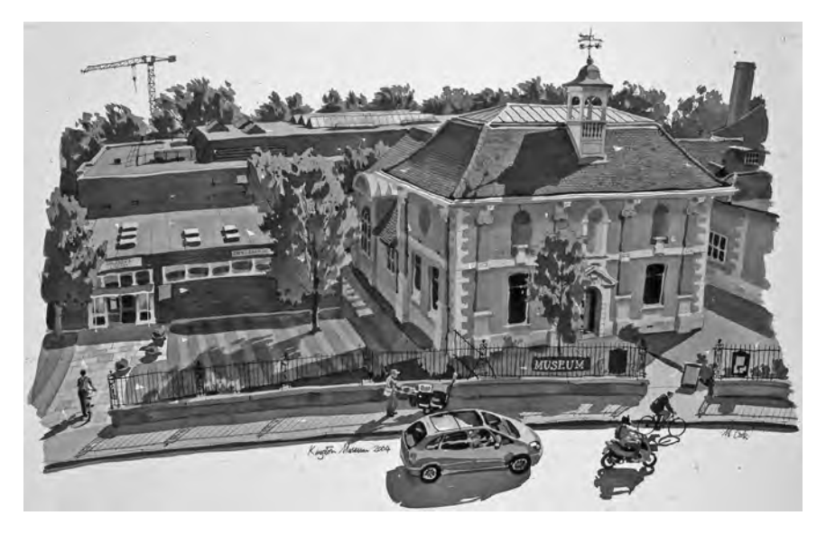
Figure 10 Kingston Museum painted by Matthew Cook, 2004 (Brill Collection no.92)

The Friends published a full colour illustrated catalogue of the Brill Collection in 2004 as a special Kingston Museum Centenary Project. The book includes biographies of the artists by art historian, Henrietta Harris and extensive