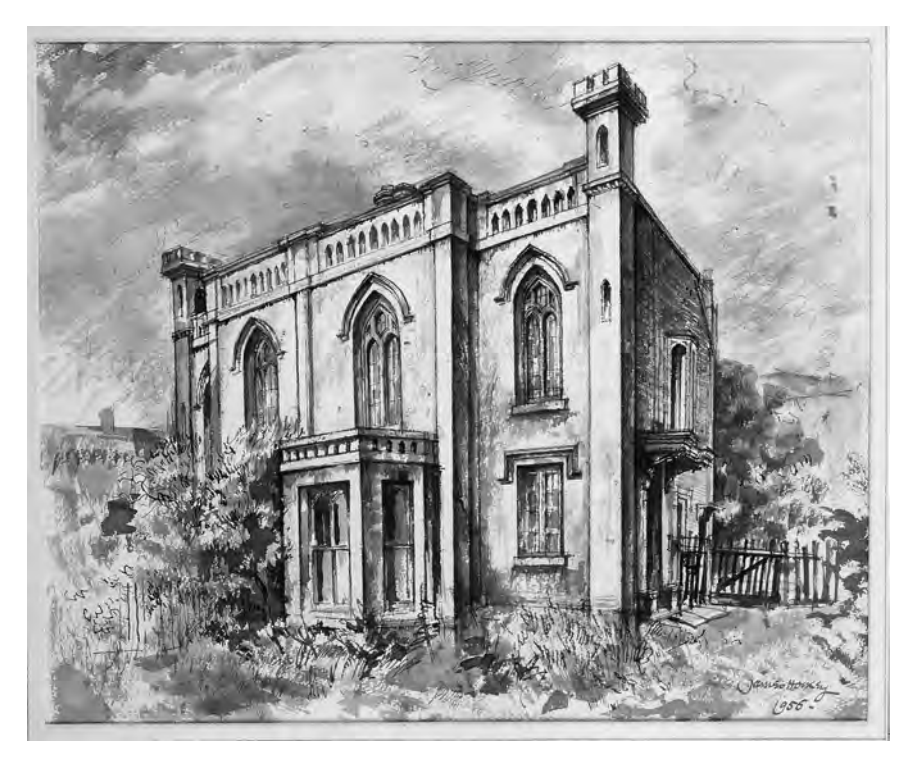
Figure 8 Semi-detached cottages, numbers 155–157 London Road, Kingston, once incorporating part of a 17th century mansion known locally as the 'The Old Manor House' that was used as a workhouse in 1836. The building was bought and converted into a double cottage with gothic frontage by sculptor Charles Westmacott in 1840 and ended up as Snappers Castle, an antique shop, prior to demolition in 1977; painting by James Hockey in 1956 ( Brill Collection no. 5)