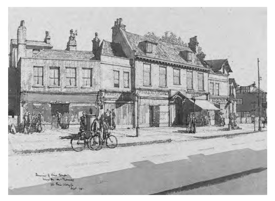
Figure 3 The Remains of Vine House in London Road, Kingston by Wilfred Fairclough, September 1941 ( Recording Britain Series: no. E2181)