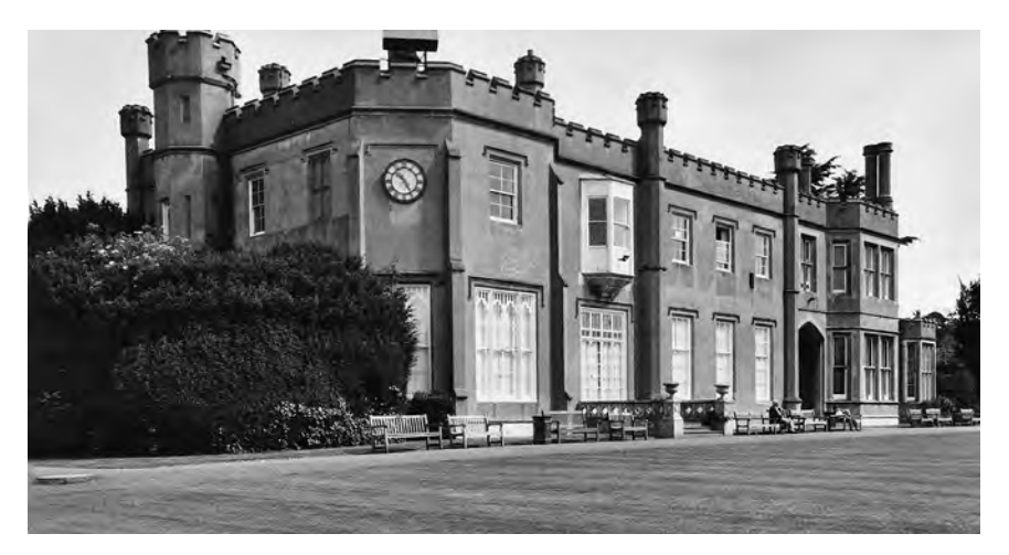
Figure 6 Nonsuch Mansion, built near the site of the palace in Gothic Revival style, architect Jeffry Wyatt (later Sir Jeffry Wyattville) in 1802–6. Strangers sometimes think it is Henry VIII's palace.

Following the demolition of Nonsuch Palace by Barbara, Countess of Castlemaine, Countess of Southampton, Dutchess of Cleveland and Baroness of Nonsuch, its two parks passed through various hands and in 1799 the Little Park was acquired by Samuel Farmer, who employed the architect Jeffry Wyatt (later Sir Jeffry Wyatville) to design a mansion that was built in 1802–6 and which still graces the park (figure 6).