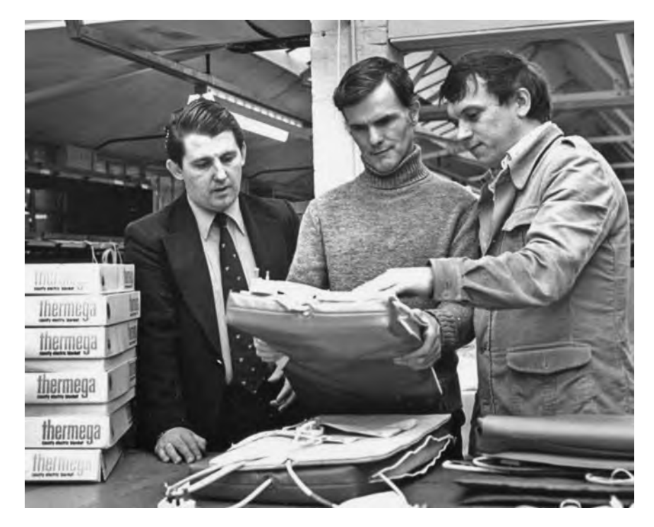
Figure 2 Workers in the Thermega Factory, undated photograph

Electrically heated pads had been developed by an American doctor, S I Russell, around 1912 particularly for use with tuberculosis patients who spent a lot of time out of doors. Thermega were the first to produce these commercially, using First World War veterans as the workforce. At a function at the Home in 1928 Sir Frederick reported that the staff at Thermega totalled 40 and he stressed the need for cottages to be built to accommodate married couples where the men worked in the factory. In 1930 twelve cottages were built at the Home and these survive in Ermyn Close. At that time the factory was producing over 500 electric blankets each week as well as some 2,000 electric pads to take the place of poultices for local heat application. He insisted that all the staff were paid a living wage. Even at the time of closure they were making nearly 2,000 blankets a week as well as a range of other products including plastic wallets, tool pouches and portfolios. They also made flare parachutes and packed parachute lines for Schermuly in Newdigate. There was a basket industry there where individuals