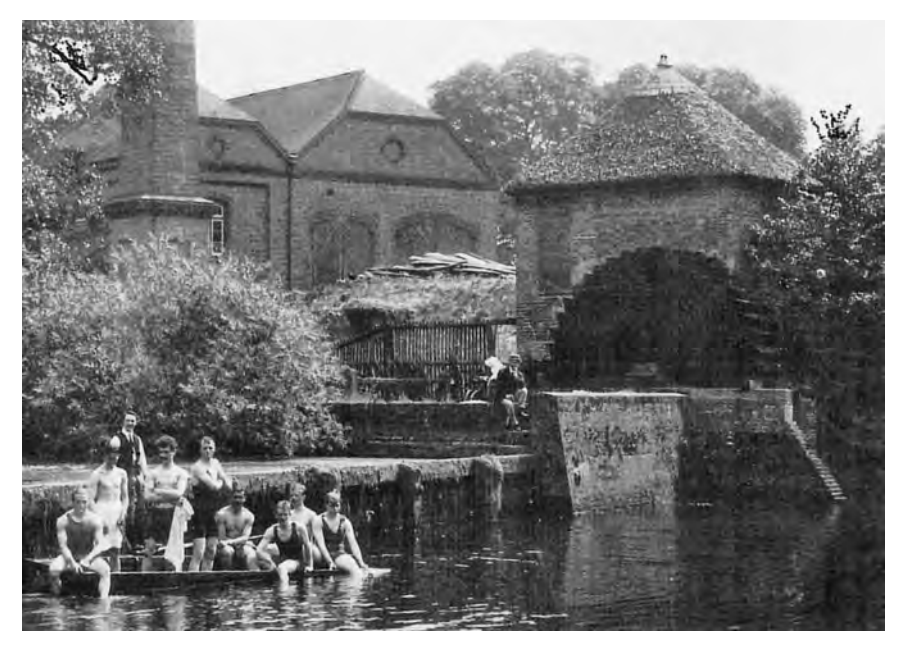
Figure 8 Photograph, taken in about 1900, of the engine house with its thatched roof and waterwheel and also, at the left, a steam-powered Deepdene estate saw mill..