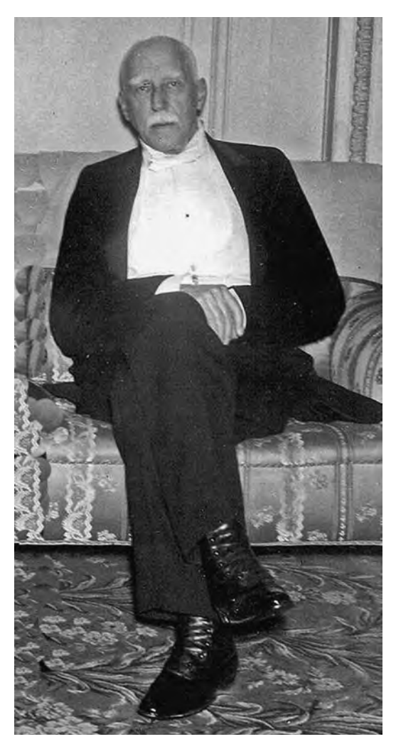
Figure 1 Sir Frederick Milner: photograph reproduced courtesy of the Milner House Care Home

A year after opening the Sir Frederick Milner Home in Leatherhead, Thermega , manufacturer of electric blankets and heating pads, employed the residents in a sheltered workshop, which they built alongside the house. The firm continued making electrically heated blankets and similar goods there until its closure in 1980 (figures 2–3).