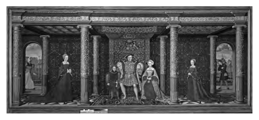
Figure 3 The Family of Henry VIII, c. 1545, Anon. The picture depicts Henry with Prince Edward and Jane Seymour. Some artistic licence was involved since Jane died in 1537 (The Royal Collection 405887 ©2010 Her Majesty Queen Elizabeth II).

and well built. The commissioners drew up a Vewe and Survey of the manor of Codyngstone that described in great detail the house and its surroundings. The surveyors were complimentary about the quality of the surrounding land and the abundance of game. The house formed one side of a courtyard on two other sides of which were barns and stables. There was a suitable spring, which could be tapped for the water supply.