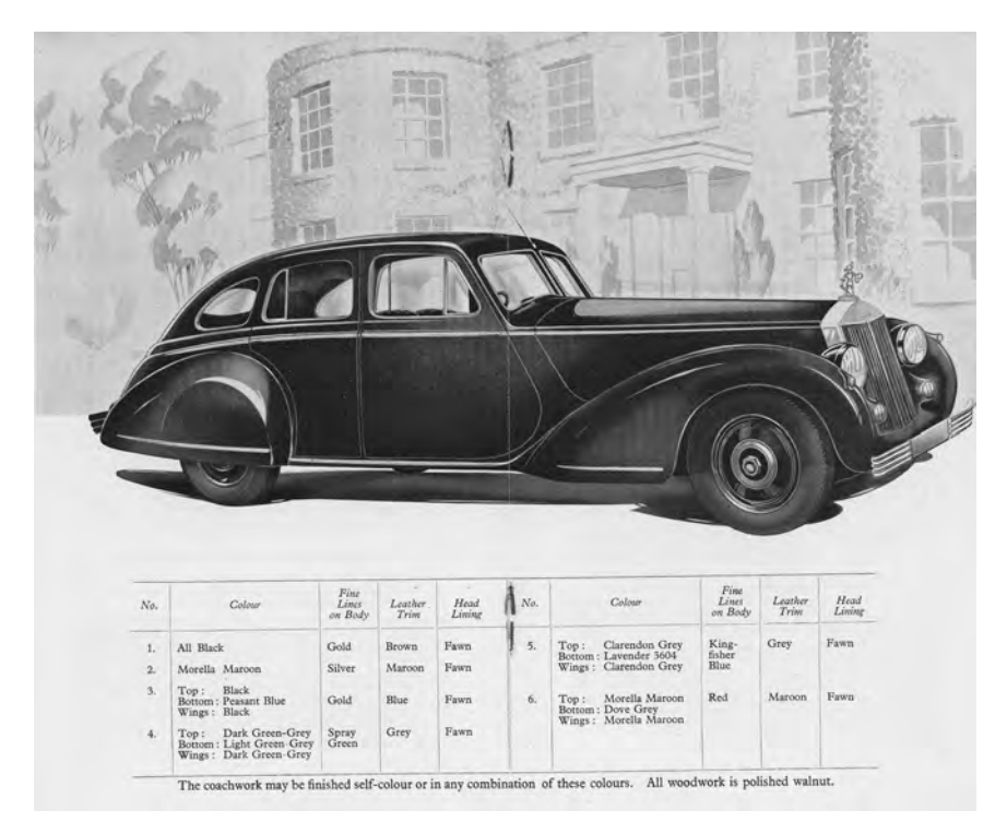
Figure 6 The Black Prince Car, made by Invicta of Virginia Water, 1946

day covers issued by one such service, established by Ministor in Epsom, as 'Epsom's Pirate Postal Service'. The strike occurred at the same time that decimalisation was introduced and the stamps issued by Ministor had face values of 1 shilling, 5 new pence, 10 new pence and 15 new pence. First day covers were issued to mark the first day of the issue of the stamps, the first day of decimalisation and the last day of the pirate postal service. Stamps issued to mark the end of the strike were overprinted, originally with the words 'Postmen Winners', which was corrected to 'Postmen Losers', reflecting the fact that the strike collapsed despite no improved offer being tabled, the Union of Post Office Workers having run out of funds (figure 7).