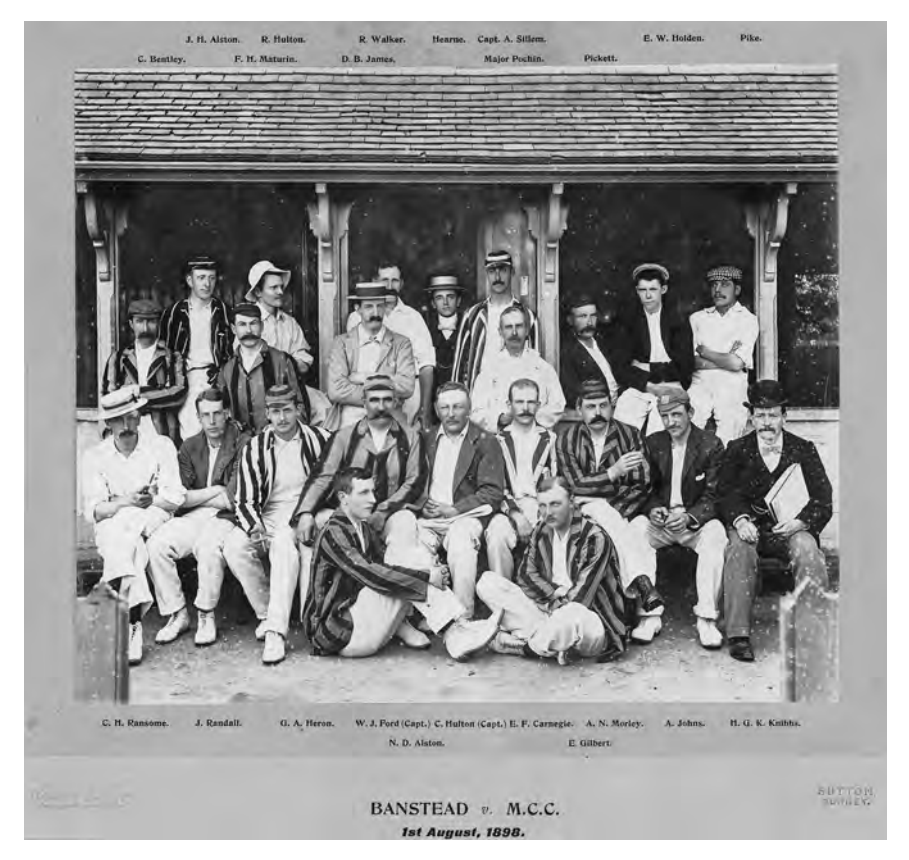
Figure 1 Banstead Cricket Club, 1898

Thames Ditton Cricket Club (ref 8767), although the records that survive do not start until 1877, was founded some 45 years earlier. Indeed, cricket was being played in Thames Ditton for some time before this since amongst papers received from the Club is a copy of The Courier newspaper containing an article on a cricket match played on Ditton Marsh on 7 Aug 1800 'between three gentlemen of Ditton against two gentlemen of Richmond, and one from Brentford'.