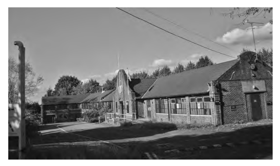
Figure 5 The empty Thermega/Remploy Factory: photographed by the author, 2008