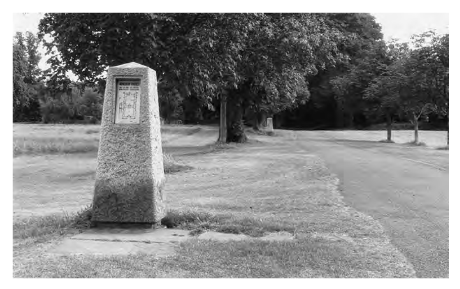
Figure 5 One of three obelisks that mark the site of Nonsuch Palace.

managed to outlive him, lingering on until 31 March. Perhaps the desire to outdo his old rival kept him going.