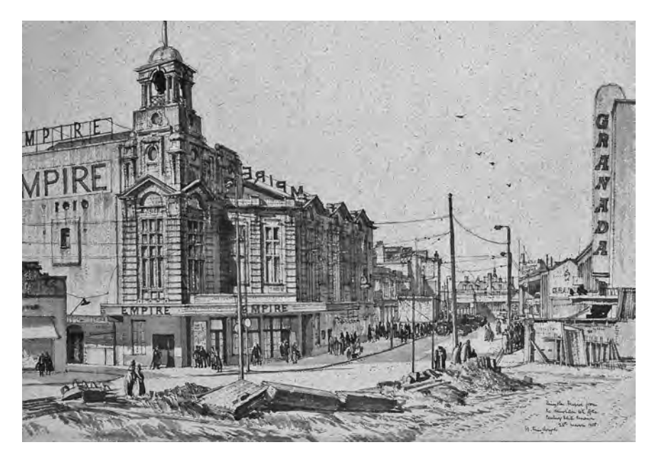
Figure 7 The Empire Theatre and the site of the Elite Cinema in Kingston, 1955 by Wilfred Fairclough ( Brill Collection no.3, reproduced courtesy of Kingston Museum & Heritage Service)

Other threatened buildings were painted but escaped: for example, Picton House in the High Street saved after a public campaign. This was the 18th-century home of Cesar Picton, successful black Kingston businessman, brought as a child from Senegal in 1761 to be a servant to Sir John Philipps of Norbiton Place. St Raphael's Church, built by Alexander Raphael in 1848, was another building to be painted when under threat but which escaped demolition and is currently (2010–2011) undergoing a major restoration.