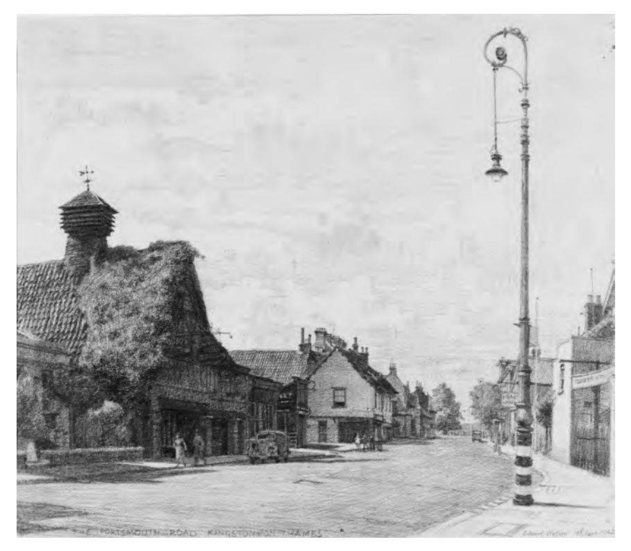
Figure 4 The Old Malt House, Portsmouth Road, Kingston by Edward Walker, 14th June 1942 ( Recording Britain Series, no. E2242)

<u>not</u> my intention to enlist the aid of the students but to obtain the services of artists of repute. These services, in spite of the small fee offered, I think I could obtain for the artists I have in mind if they could be persuaded that they were taking part in a very worthwhile scheme which would place a sample of their work in a public collection. I am actuated only by a desire to obtain for the Borough at the minimum outlay a collection which would do it credit'.