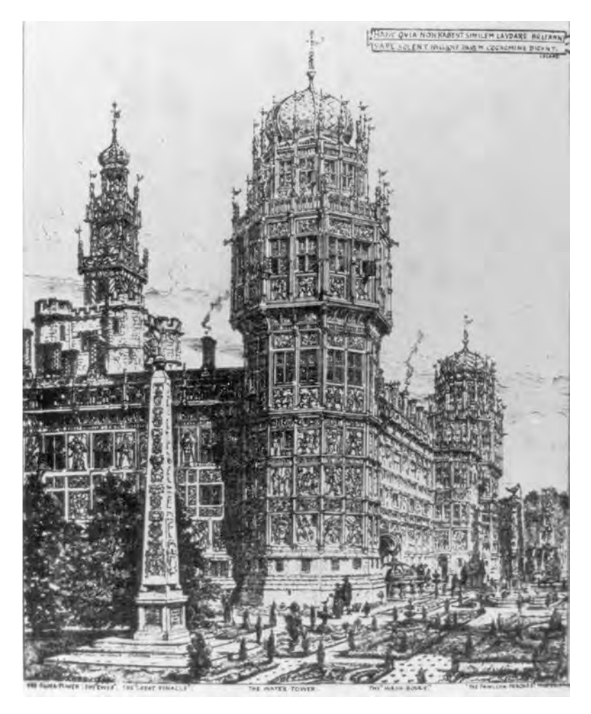
Figure 4 An imaginative reconstruction of the south-west corner of Nonsuch Palace ( The Builder , 1894).

The walls of the inner court of the palace were even more lavishly decorated all around with panels of stuccoes with figures moulded in high relief. From the first floor up there were three bands of figures: at the top were the heads of 32 Roman emperors. Below them, on the west side where the King's chambers were,