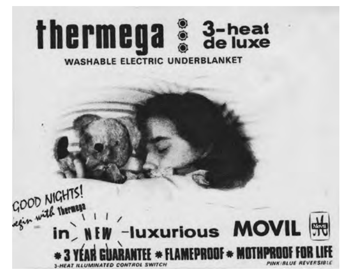
Figure 3 One of many advertisements issued by the Thermega Factory

referred to the Society were given work and, if they showed aptitude for normal commercial manufacturing, were transferred to the blanket factory.