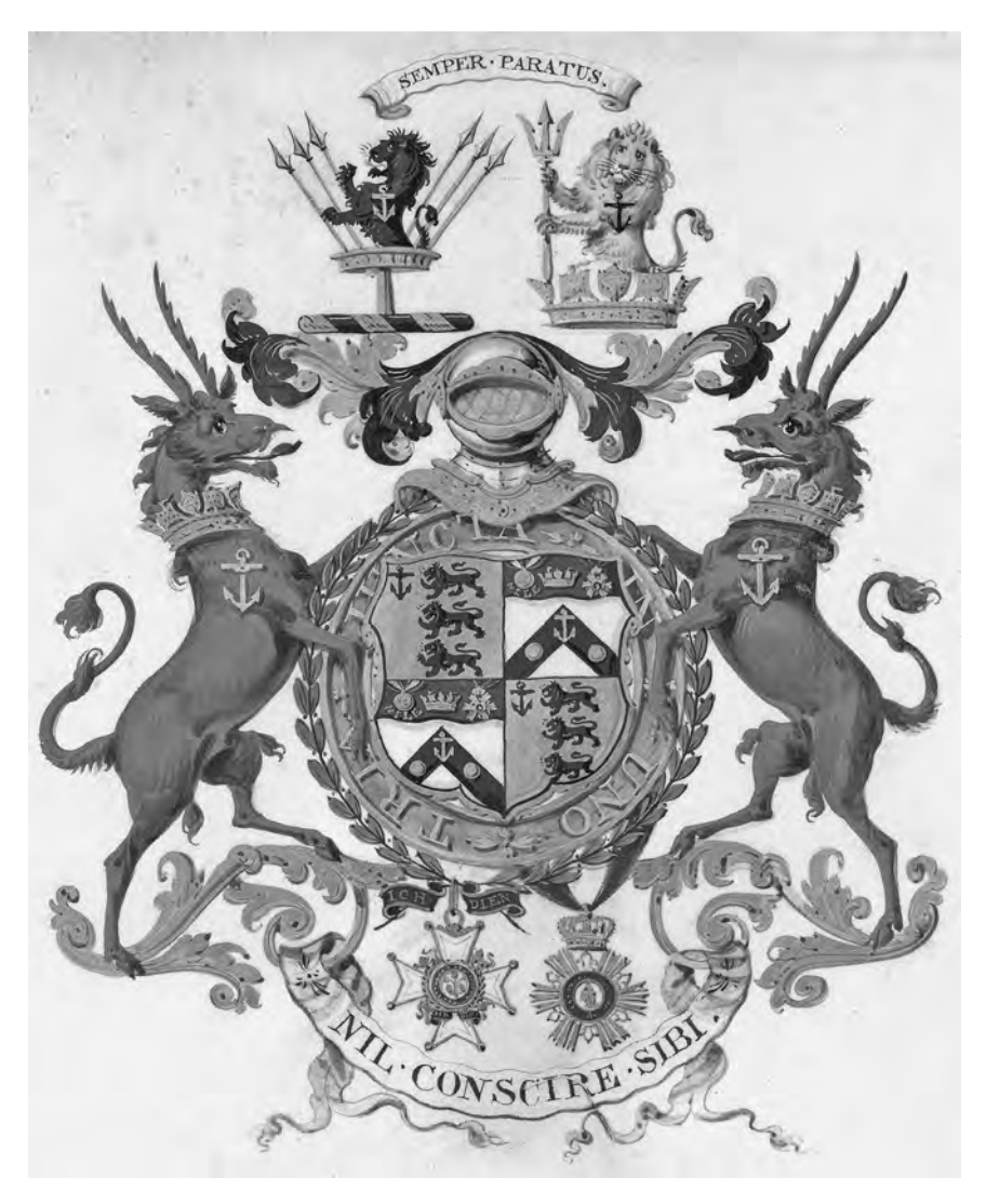
Figure 3 Coat of Arms with newly granted supporters of Admiral Sir Benjamin Hallowell-Carew, 1829