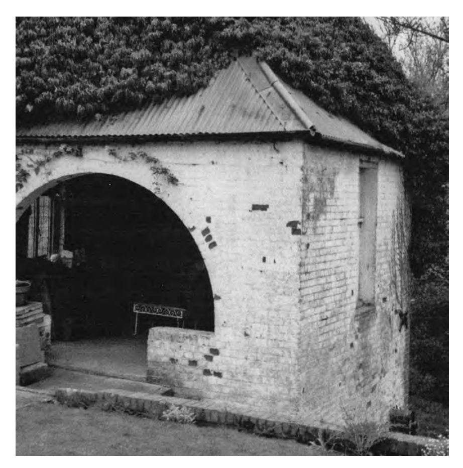
Figure 4 Photograph of the arch in the south wall of the engine house taken in the early 1990s, when the building was almost covered with vegetation and the roof was of corrugated iron.

The engine house, as shown in figure 3, has two storeys, a pyramidal tiled roof and a timber waterwheel about 17 feet in diameter and 3 feet wide. This has about 46 floats and is of low breast-shot type. It must have pumped water up about 65 feet to the Castle, which was 350 yards to the south-east, and also perhaps to the kitchen gardens. Figure 3 does not show the south face of the building opposite the waterwheel. This has an arched entrance as seen in figure 4, which is a photograph taken in the early 1990s. At the top of this arch on the inside of the building the date 1832 has been formed in wet plaster. This arch is a very skilfully cut addition to the building and the date suggests that this