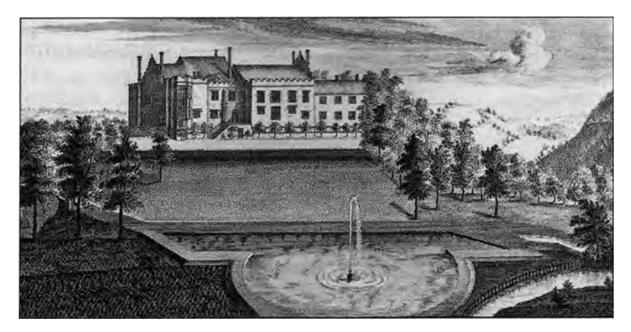
Figure 1 Engraving of Betchworth Castle from the east, S & N Buck, 1737.