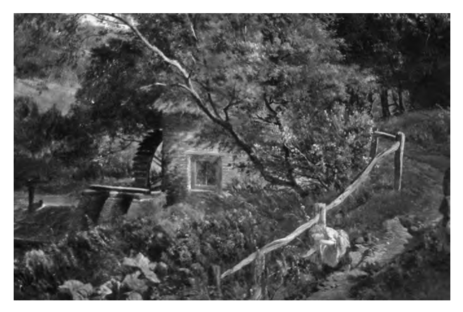
Figure 7 Detail of a painting, of about 1872, by Sidney Richard Percy [Williams] showing the thatched engine house and its waterwheel looking upstream. The original, which is unfortunately damaged, is held by the City of York Art Gallery.

The directors of the Company reported in June 1897 that they had 'obtained an excellent supply of water at Deepdene in both quality and quantity'. A year later they stated that 'a borehole was sunk to a depth of 100 feet alongside the Mole at Castle Gardens', which supplied 11,000 gallons per hour. They were also replacing the old timber waterwheel of the engine house with an iron one, installing new pumps and laying a 7 inch pumping main to Deepdene. The work was completed by February 1899 but they soon discovered that the water contained sand and therefore had to be pumped to their Tower Hill reservoir where they were installing appropriate filters. This meant that the water had to be raised about 330ft. Then in 1902 they purchased land near the Pipp Brook about 400yds south of Dorking West railway station and built a new steampowered pumping station (TQ 162 495), which became active in 1904. Other supplies of water also became available to the Company and the Castle Gardens pumps probably became redundant by 1919.<sup>16</sup> A photograph of the engine house taken in about 1900, still thatched but with an iron waterwheel, is shown in figure 8. This photograph also shows a large steam-powered estate saw mill, built between 1870 and 1896, immediately upstream.