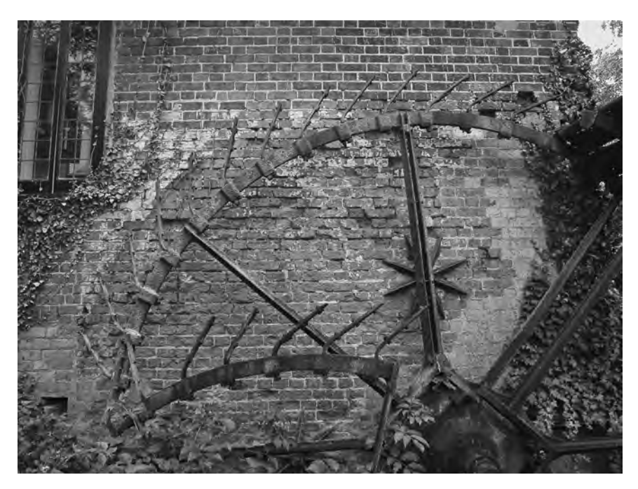
Figure 9 Photograph of the derelict iron waterwheel of the engine house taken in 2010.

were 46 curved sheet metal buckets, 13ins deep but almost all of these have become detached. The owner plans to restore this wheel but unfortunately the water supply has been lost so it will not turn, unless powered in a different way.