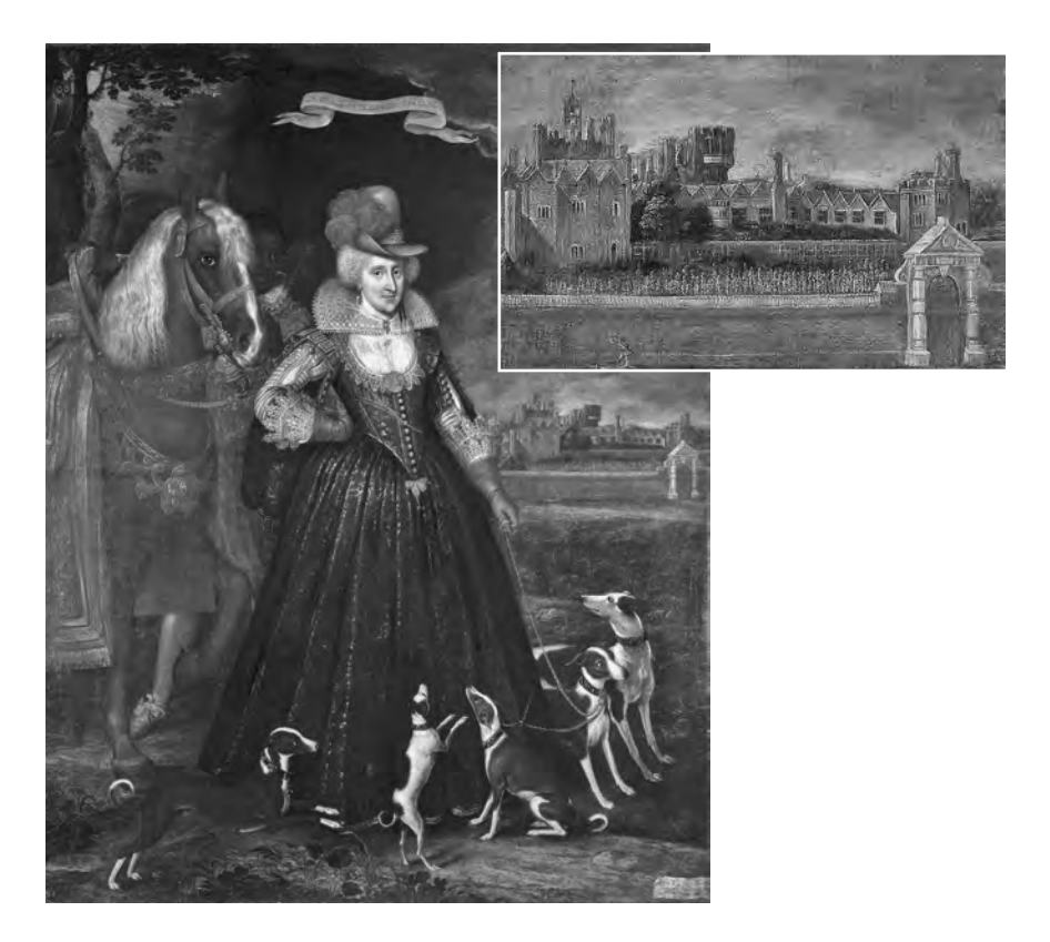
Figure 2 Portrait of Anne of Denmark by Paul van Somer, 1617, showing Oatlands Palace in the background (see detail).

enlarged and turned into a mansion that burnt down in 1794. It was rebuilt in Gothic style. The estate was broken up in mid-Victorian times, and the building is now Oatlands Park Hotel.