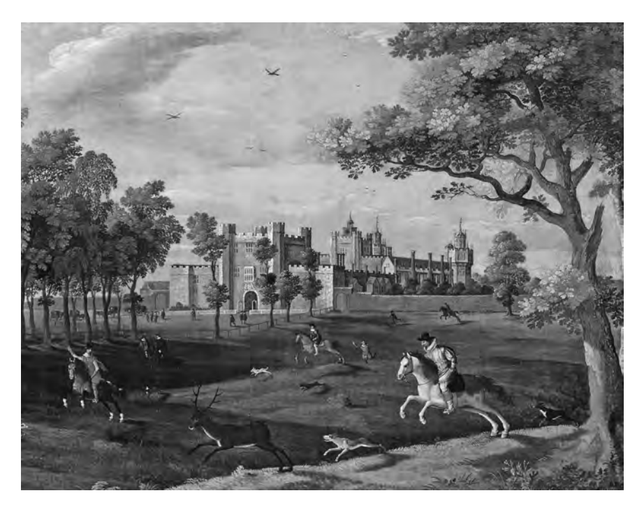
Figure 1 Nonsuch Palace: detail from a view from the northwest by an unknown artist, c. 1620.