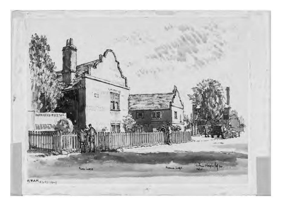
Figure 2 Farm Lodges in Petersham by Wilfred Fairclough, July 1941 ( Recording Britain Series: no. E2183)

The pictures were on long-term loan to regional collections around the country between 1955 and 1989 but were brought together again in 1990 by the Victoria & Albert Museum where they can be seen in the Prints and Drawings Room. Some paintings were not returned and are currently still being sought by the Museum.