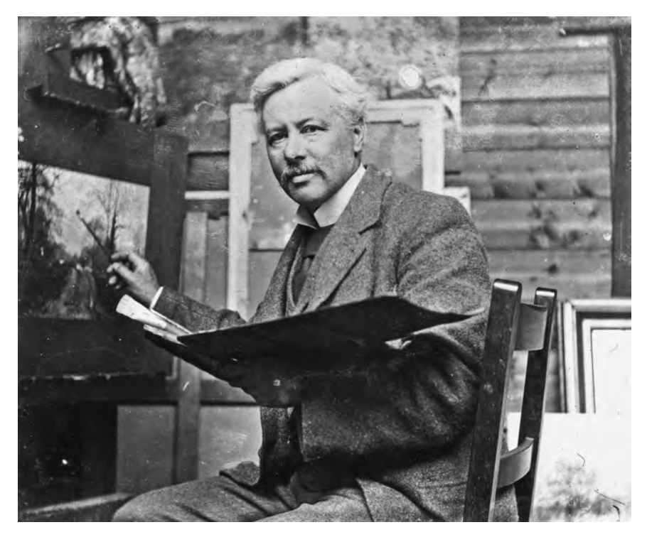
Figure 2 The artist Edward Wilkins Waite (1854–1924)

E W Waite's records touch on all aspects of his life and work. In particular they include his sketch books. Sometimes his sketches include detailed narrative,