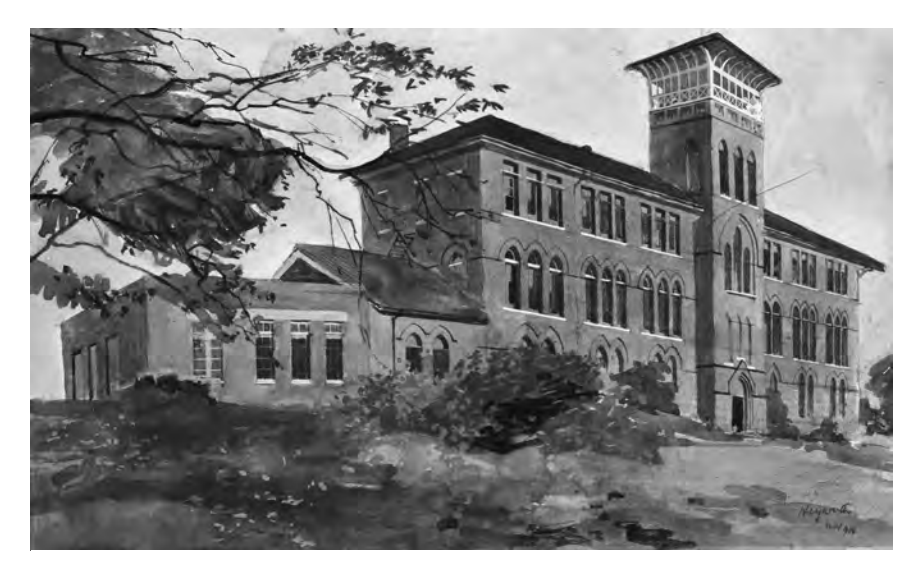
Figure 9 Dr Barnado's Home, closed in 1968 and demolished soon afterwards to make way for Blenheim Gardens near Kingston Hospital; painting by Alfred Heyworth, 1968 ( Brill Collection no. 45, reproduced courtesy of Kingston Museum & Heritage Service).

was bequeathed to Surrey County Council subject to the brothers' life interests. The intention of the bequest was that art students might 'reside economically and work under agreeable and healthy conditions as free from restraint and encumbrances as possible'. Major Gayer-Anderson died in 1945 and his brother in 1960. Surrey County Council closed the hostel in 1969 due to the loss of a large number of its art students to the newly established Greater London Boroughs, especially, ironically, those from Kingston and Wimbledon.