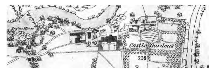
Figure 2 Detail of the 1:2500 Ordnance Survey map of 1870, showing Castle Gardens at the right, the adjoining stable block designed by Sir John Soane on its left and the Engine House, on the south bank of the River Mole adjacent to the weir, at the extreme left. North is at the top and the area shown is 450 yards across.

Figure 3 shows a mature building which suggests that it was probably built by Abraham Tucker. Indeed, in 1738, the first public water supply in Dorking with an engine house (TQ 164 496) powered by the Pipp Brook, a tributary of the Mole, was constructed under his auspices.<sup>8</sup> It seems likely therefore that he would have installed a water-powered pump for his own house. However, it has been suggested that there could have been an earlier water engine which pumped water from a well (TQ 191 502) alongside the Mole on the east side of the Castle. Indeed, a building is shown at this location on a pre-1691 view of the Castle but