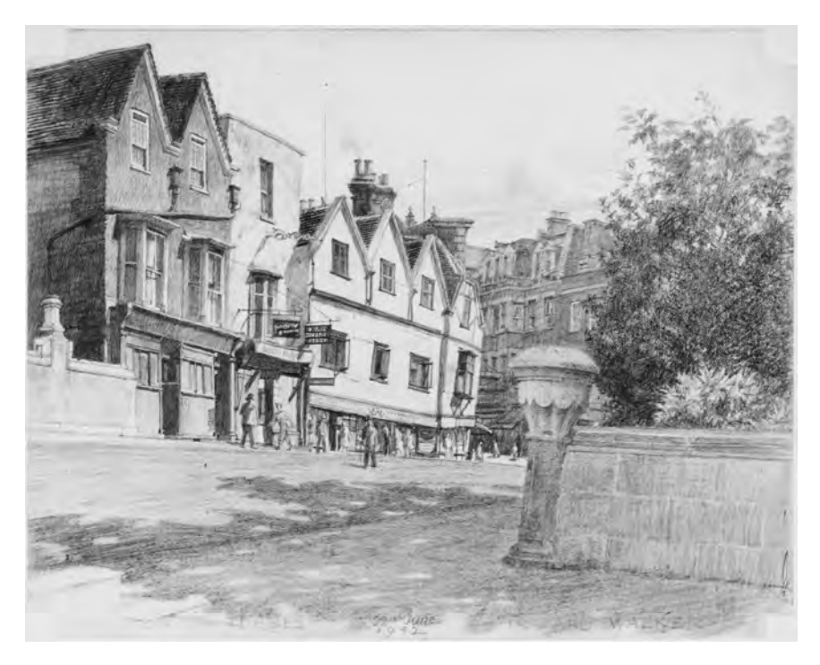
Figure 6 Clattern Bridge in Kingston looking towards the Market Place by Edward Walker, 22nd June 1942 ( Recording Britain Series, no. E2240)

we were too late with the Elite, a building which with all its faults was very typical of the period'. The demolition site of this once well-known Kingston cinema was however captured by Wilfred Fairclough in 1955 (figure 7). In 1956 the Town Clerk was anxious to record the building known as 'The Old Manor House' in the London Road (used later as a workhouse), which had a planning application in for its demolition; the suggested fee was on the table at £5. But Brill was by now expressing some concern for the level of fees offered saying he 'no longer has the face to ask artists of repute to make drawings for £5' and 'goodness knows', he says 'what will be necessary in three or four years time'. James Hockey was commissioned to paint this building for £7 10s. (Figure 8).