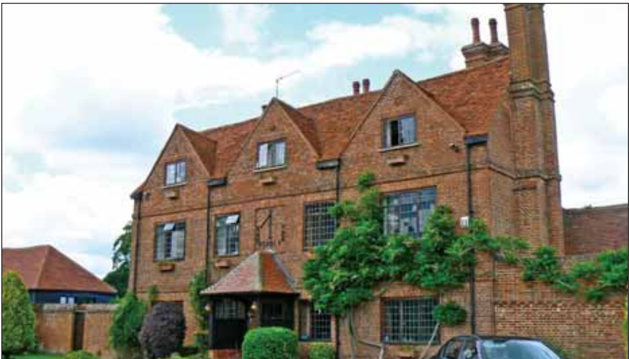
The Manor House at Send Marsh Green: visited during the summer meeting of the Surrey Local History Committee

This year the Committee’s summer meeting was hosted, on Sunday 20th July, by the