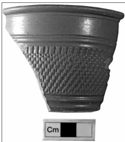
ASSTEAD ROMAN VILLA: Fragment of samian cup of form Dr. 30R

The foundations were made by digging trenches into the clay and packing them with flints, roughly coursed. The walls above foundation level were also entirely of flint, except for the tile-reinforced corner, already described. In excavation the wall lines were seen before walls as such were found, which suggests that Lowther found the walls in some way and left an un-dug piece of site debris above them, as though each room was a trench and the walls were the berms. The wall between rooms 10 and 12 refused to turn into a 'proper' wall until foundation level, but there was so much debris along the line that the most reasonable explanation is that it was treated as a 'wall' by Lowther but was in fact a robber trench which was left standing as an island. A mortared floor level was found in room 11 but the others had only a disturbed sticky grey layer over the natural, most probably a mixture of trample in the 1920s and the original ground surface. A possible tile hearth was located in room 10.