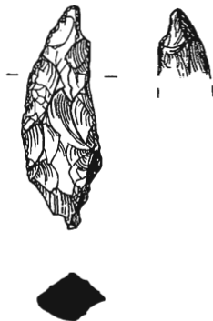
WEST HORSLEY: fabricator? (scale 1:2)

There is a possibility that the grassland where they were found might be cleared in the near future to make the prospect of a field walk a possibility, and I will keep this in mind.