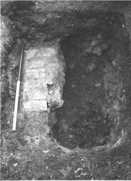
FARNHAM CASTLE: Earlier terrace wall

the late 17th or 18th centuries seems not unreasonable as a best guess. What seems almost certain is that the buried wall represents the remains of an earlier retaining wall left 'fossilised' to the rear when the present terrace wall was constructed. An engraving of 1830 shows the south front of the castle with a southern terrace wall, which is obviously different from the present one, and it may be that this is what was exposed in two of the three trenches.