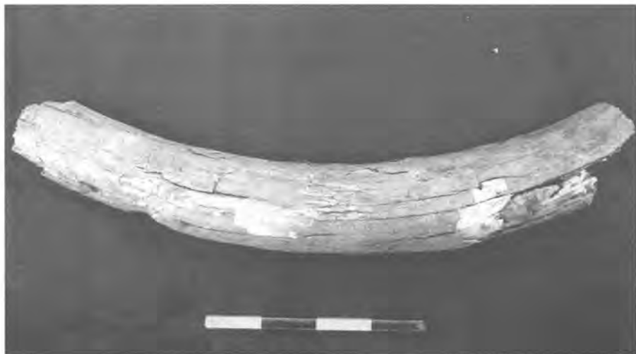
Mammoth tusk from Badshot Lea

Finds of mammoth tusks, teeth and bones, and the teeth of woolly rhino and of other extinct species that bear witness to a cold climate are, or were, quite common from the river gravels of Terrace D, one of a series of terraces long recognised in this part of the Wey valley. These gravels survive in parallel strips lying either side of the River Wey and form the ground on which Farnham is built to the north of the river. The southern part of the terrace was extensively quarried in the late 19th and early 20th centuries when quantities of mammoth and woolly rhino remains were recovered and reported in the 1939 SyAS publication A Survey of the Prehistory of the Farnham District .