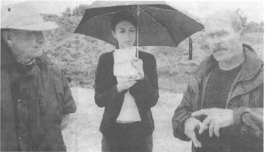
That's me, the site director, under interrogation from the Surrey Mirror reporters