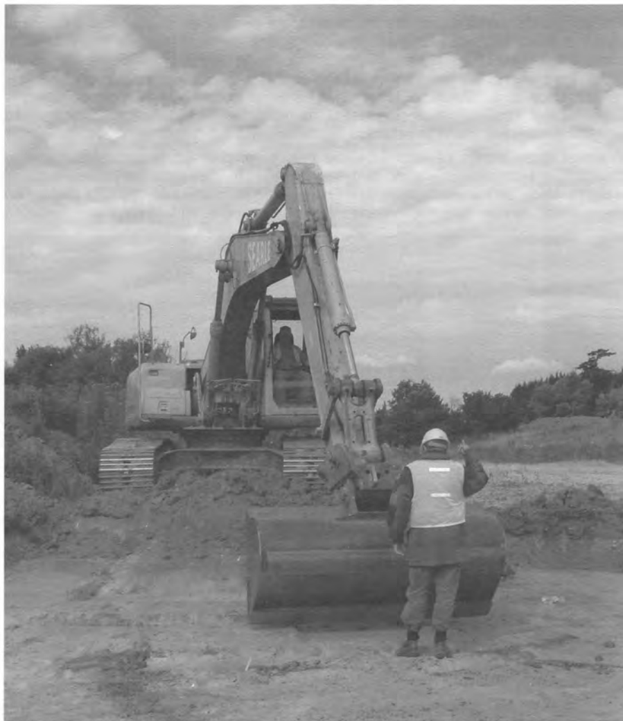
THE BIG BLETCHINGLEY STRIP