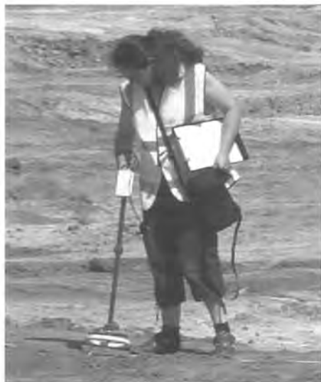
Geophysical survey underway

by another, on hire, who had not driven for some time and had no experience of archaeological requirements, We did what was possible, but the site still looked a mess. That's not to say that it had been easy to do, however, since it meant stripping baked ploughsoils from loose sands around the fringes of the hollow, and, at least in the first day of work, an attempt that proved impossible to perform, to peel off the ploughsoils to within 5cm or less from the underlying 'dark deposits' This was one of the stipulations for the efficacy of one or more of the geophysical surveys being undertaken, although no serious suggestions as to how this could ever have been possible were made. Another requirement of the geofizz bods, and one that will become an increasing irritant, is that, because no substantial metal was allowed within 30m of the