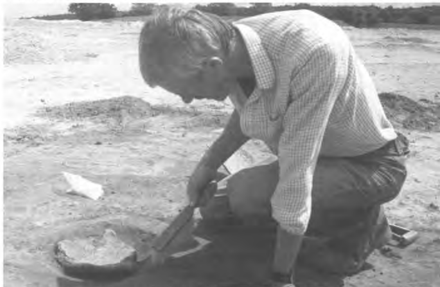
Base of a Late Bronze Age vessel being cleaned for photography

The first week of stripping had been largely uneventful and under blue skies until a storm on the Friday, but the generally dry conditions continued for the rest of the