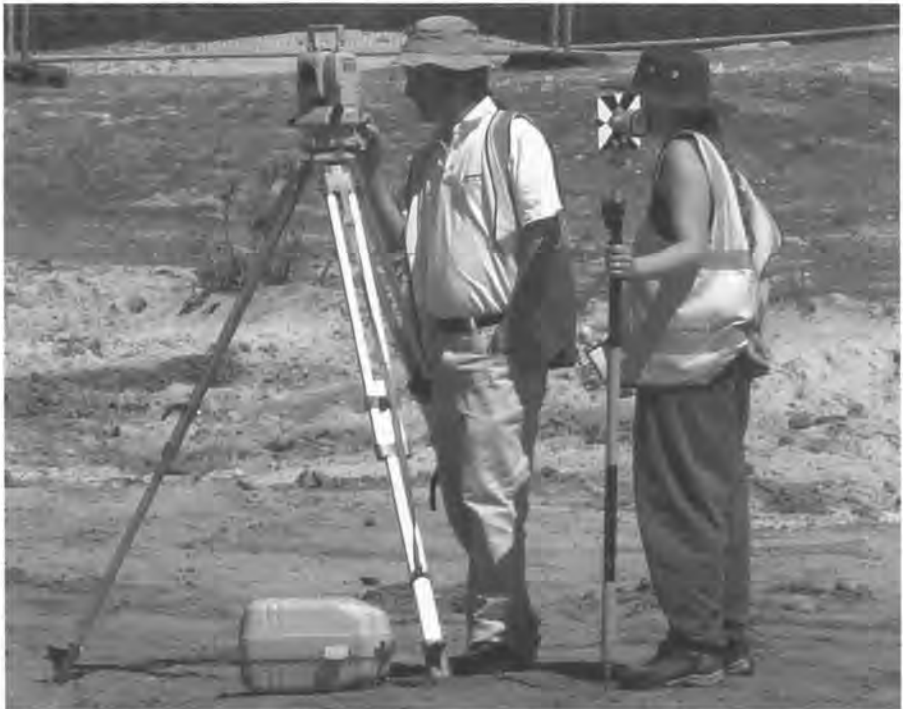
MOLAS staff surveying the site

The first three weeks of work involved the stripping of up to almost a metre of ploughsoils, both ancient and modern, from a series of 'dark deposits', which required a big machine and a big dumper. The Del-boy digger of the first day was sacked on the second, and the quarry company's excellent stand-in for two days was replaced