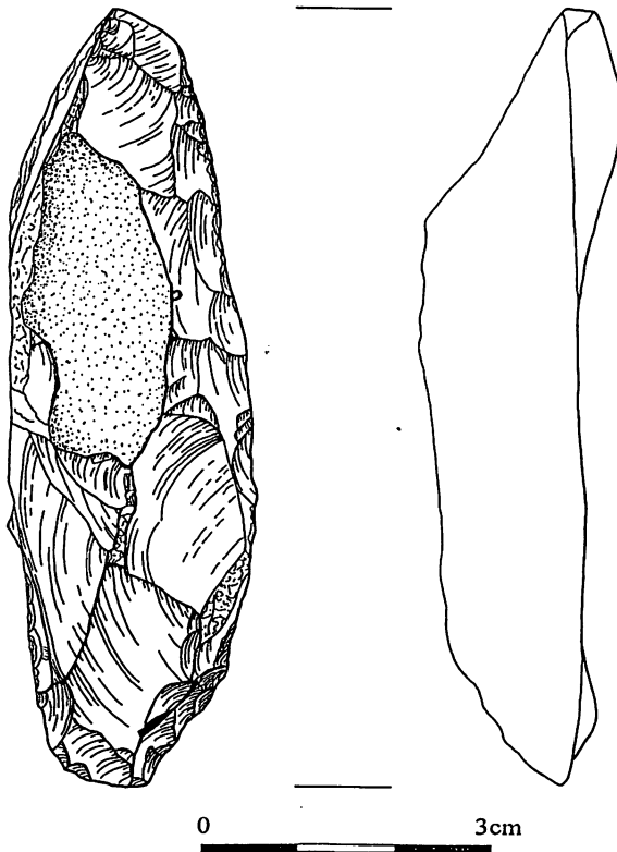
Flint fabricator from Thursley Common, found by Mr Ray Fry.

Over the winter the wardens kindly lent their collections for recording and as a result it has been possible to locate two, previously unpublished medium sized Mesolithic sites, producing boxes of waste flakes. We have also drawn a number of individual finds of barbed and tanged, leaf and transverse arrowheads as well as scrapers, awls, a tranchet axe, a fabricator, etc. Most of these latter finds come from tracks and firebreaks on the Common and seem to cluster in two main areas, on drier ground to the south east of the bog. Pat Nicolaysen has examined the finds, which are of Mesolithic, Neolithic and Bronze Age date and certainly indicate exploitation of the area during those periods. Occupation in the Bronze Age is perhaps not surprising given that last year's excavation seems to indicate that the two mounds are tumuli.