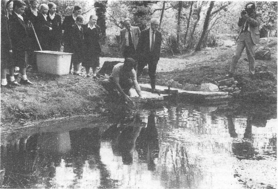
Carp being released into the moat, watched by some of the guests