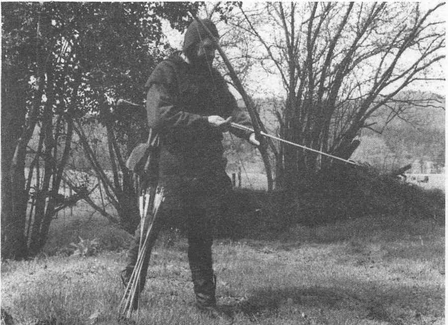
A demonstration of medieval archery