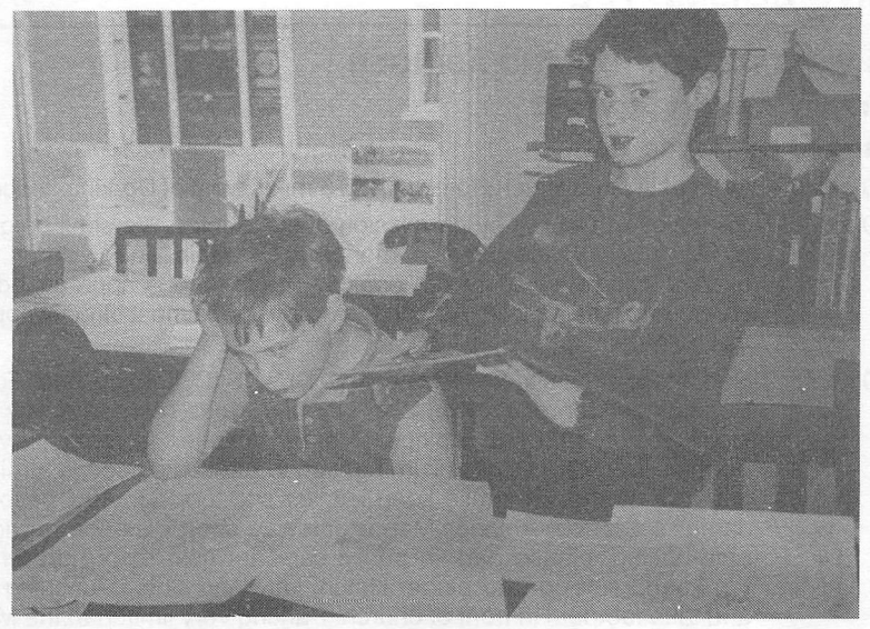
YACs in the Muniment Room. In March 1993 YAC members took part in a session in the Guildford Muniment Room at Guildford Museum. They looked at documents relevant to the village of Compton, which they will visit on April 17th.

Volunteers are needed and also help with refreshments. Telephone Sue Roggero on 0483-444752 for details.