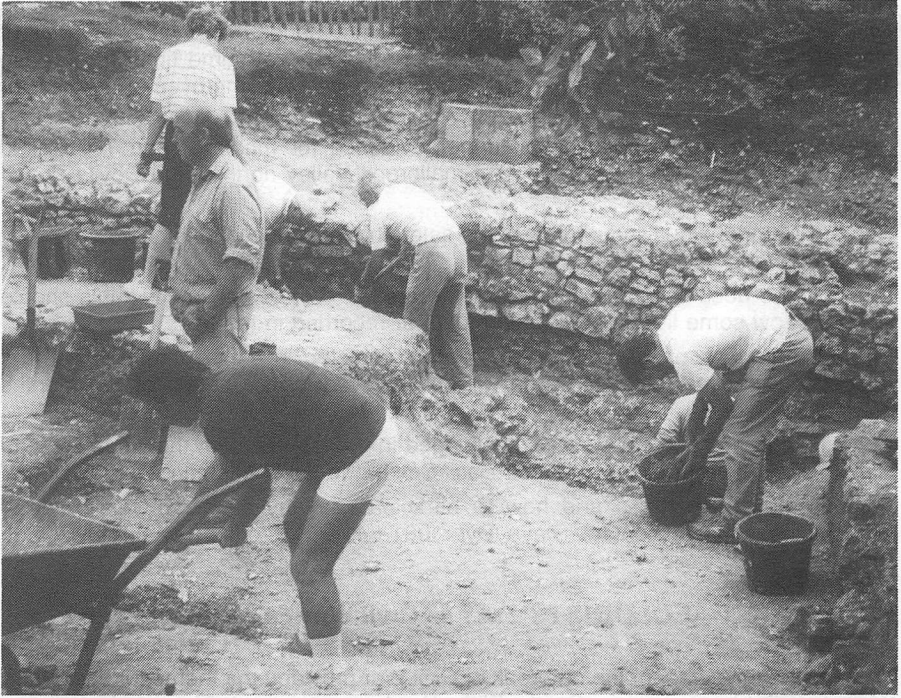
View of the 1992 season of excavation at Guildford Castle.

being uncovered. In the south west corner, hardly 45cm below the present surface, dressed stonework of the base and jamb of a doorway emerged in perfect condition. Amongst those visiting on 19th July was Jac Cowie, who was inspired to write the following, entitled "A Piece about the Palace" — Those of us in the Guildford Group have been waiting for an opportunity to learn more about the Palace. Some years ago while I was working in the SAS Library at Castle Arch, a neighbour came to say that men working on the road surface of Castle Hill had uncovered the footings of a wall running across the corner into Lewis Carroll's house; we tried to trace it further without success but, in imagination, I had already become to see the wings of the Palace rising. Rob Poulton's lucid exposition did much to make sense of the seemingly random remains of walls and pits — but opinions as to why a wall runs at an unusual angle to the main line, why a pit yields so many bones, and why a pretty little bronze ladle is too small for soup — still leave room for my imagination!