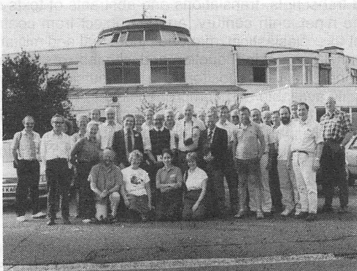
Delegates to the AIA Conference during a visit to the “Beehive” terminal at Gatwick on 11th September.

The Annual Conference of the AIA was held at the University of Surrey from 7th to 13 September. Over 100 delegates attended at the weekend and 40-50 were present for the programme during the following week.