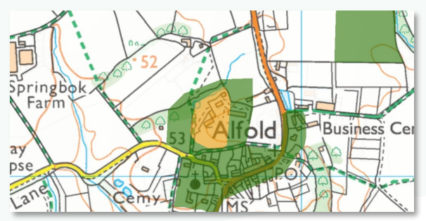
Remains of a Norman ringwork and bailey were discovered during routine archaeological work ahead of development. The newly created County Site of Archaeological Importance (WA223) and Area of High Archaeological Potential (WA224) will ensure that the archaeological implications are taken into account and any future development impact is appropriately managed.

A detailed explanation and discussion of the Archaeological Area criteria and review methodology is in preparation and due to be