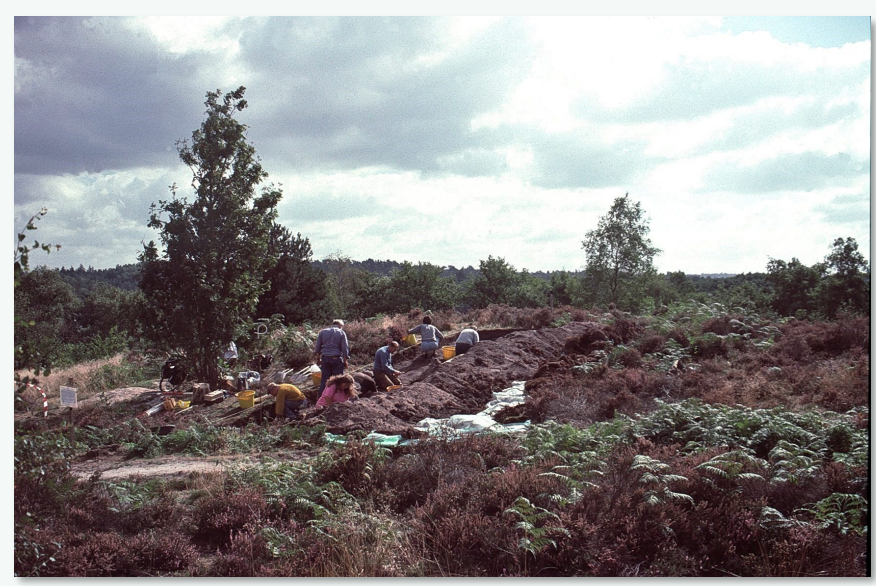
Warren Hill barrow dig 1996