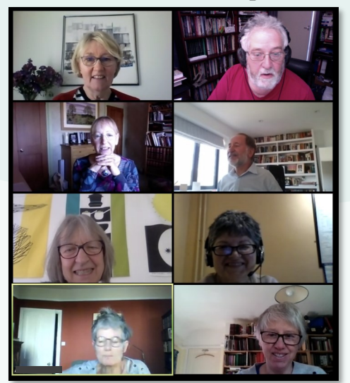
Palaeography sessions continuing online

As a society we have had to severely curtail our activities and the opportunities we are able to offer. However there are positives in the way we have been forced to react to Covid and its restrictions. From relying on just physical meetings, we have embraced Zoom, and this has enabled us to keep functioning. Our trustees, council and committees meet online,