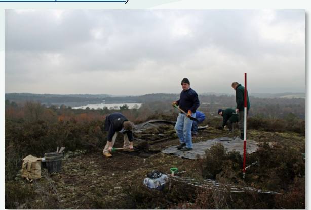
Restoration of south barrow on King's Ridge, overlooking Great Pond