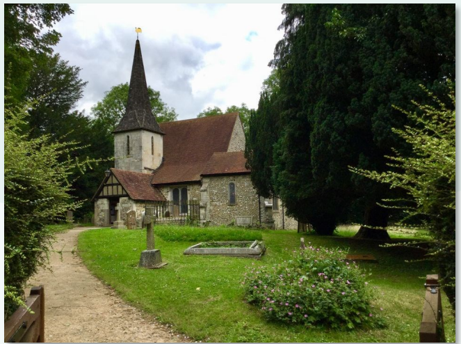
Chaldon church