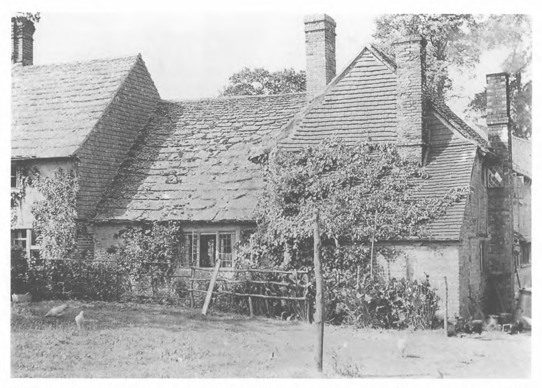
Fig 11.2 Aldhurst Farm from the rear. This shows the smoke-bay range to the left, the end elevation of the detached kitchen from Tepehams on the right, and the central linking bay.