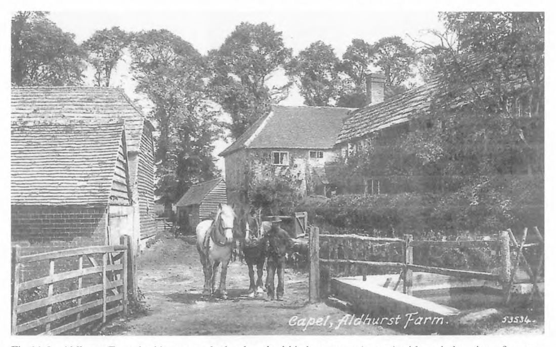
Fig 11.3 Aldhurst Farm looking towards the detached kitchen range (centre) with end elevation of crown-posted barn on left (since removed).