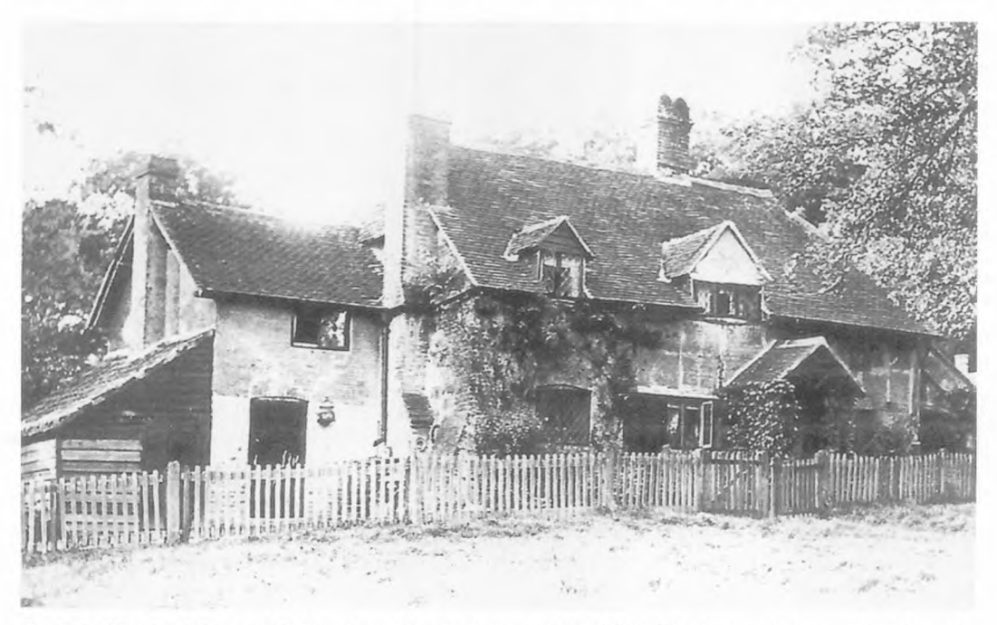
Fig 11.1 Highland Cottage, Coldharbour, Capel, photographed \varepsilon 1930. This is a good illustration of how the outward appearance of an old building can be very deceptive. It gives no clue to the 'notable early features' noted by Peter Gray of a fine open truss and evidence for a low-floored end. Dorking Museum: SC5/197

Jetties in the countryside do appear to have been used as an aesthetic rather than as a functional detail, as the extra accommodation achieved was hardly significant, and a face jetty could make framing the roof more complicated. The Wealden with a single roof is the most effective design visually with the least structural complications. Although the style appears to have originated in the Weald, where the greatest concentrations are found, it spread throughout the country and was adapted for different requirements. The database has revealed a concentration of the type in the southern half of the county, with significant clusters to the east (fig 11.4).