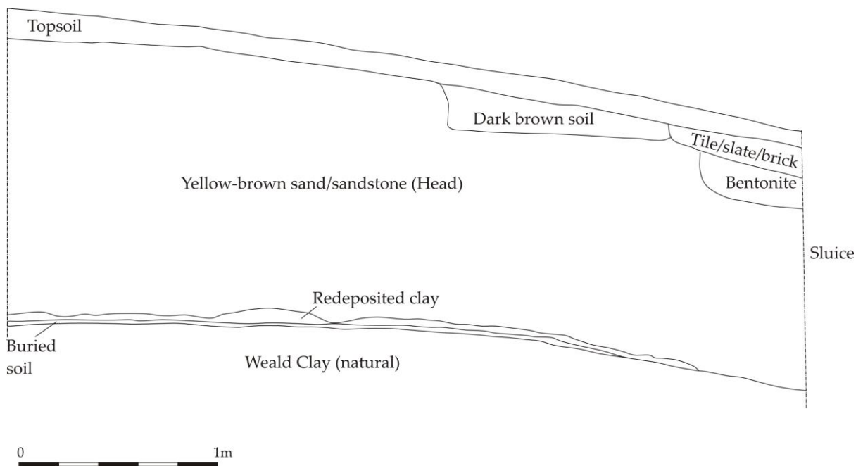
West section of dam repair trench