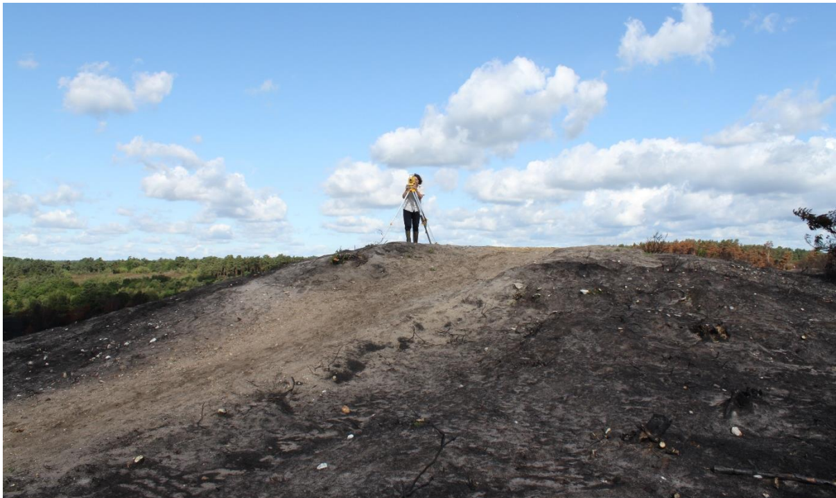
Fig 1 Surveying the northern mound in 2010