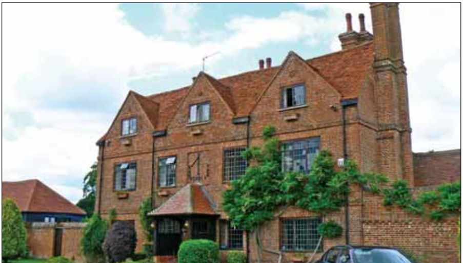
The Manor House at Send Marsh Green: visited during the summer meeting of the Surrey Local History Committee

This year the Committee's summer meeting was hosted, on Sunday 20th July, by the