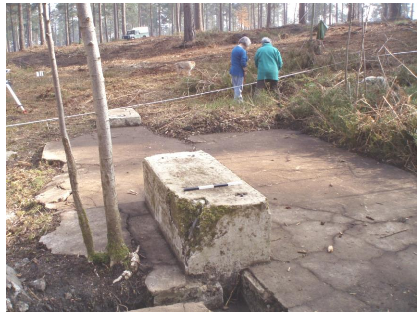
Figure 2 Rose and Jen measure the generator base

Reference to the Swiss Federal Archive also disclosed contemporary reports of the camp, done for the Red Cross and the Germans.